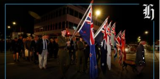
Whangārei dawn service